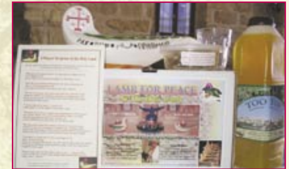
The «Peace Lamp» kit

Despite the villagers' love of their Land, they are inclined to leave, due to the difficulties resulting from the Israeli-Palestinian conflict and the lack of prospects for the future.