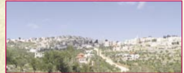
The initiative particularly aims at stopping the massive emigration of Taybeh people abroad.

Out of the 3400 inhabitants living in Taybeh 30 years ago, only 1500 remain today.