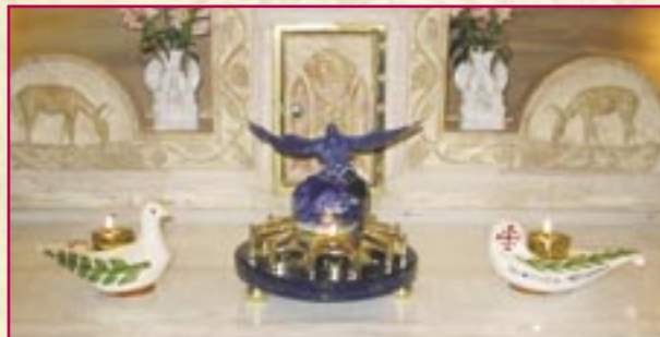
Peace Lamps: «Traditional lamp» and «dove» models