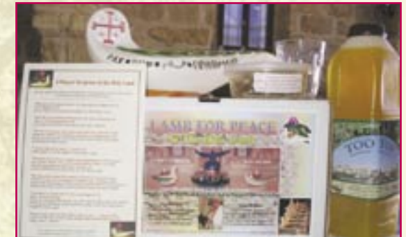
The «Peace Lamp» kit

Despite the villagers' love of their Land, they are inclined to leave, due to the difficulties resulting from the Israeli-Palestinian conflict and the lack of prospects for the future.