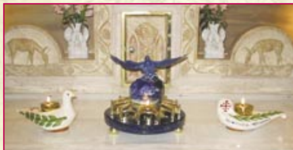
Peace Lamps: «Traditional lamp» and «dove» models