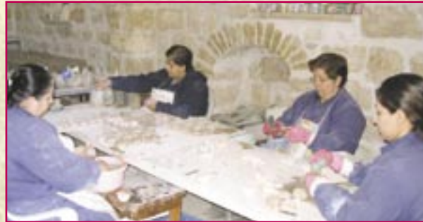
The «Peace Lamps» provide jobs to 20 Taybeh people

This initiative is an informational tool regarding the unbearable conditions that the Christian communities of the Holy Land are facing due to the long-lasting conflict.