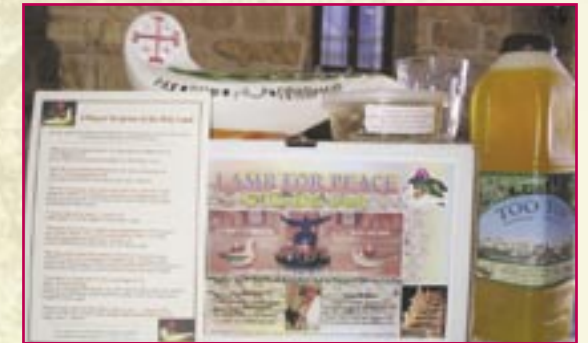
The «Peace Lamp» kit

Despite the villagers' love of their Land, they are inclined to leave, due to the difficulties resulting from the Israeli-Palestinian conflict and the lack of prospects for the future.