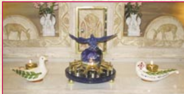
Peace Lamps: «Traditional lamp» and «dove» models